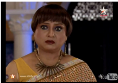
(4) Fear http://www.tubechop.com/watch/731881