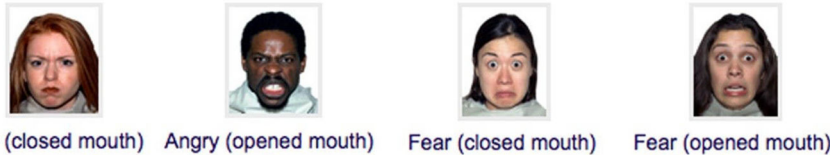
Figure 2. Example photos from the NimStim Set of Facial Expressions (Tottenham et al., 2009).

Ingroup/Outgroup Bias — Protocols for Stage 1 and Stage 3 (of Study 3) contained questions from the Social Distance Scale (Byrne, 1971) to check for in/out-group perceptions. This study found no differences between high-psychopathy and low-psychopathy respondents to questions that asked whether they could be friends with targets in the photos and videos, or whether the targets would fit into respondents' social groups. No patterns arose connecting respondents to targets of their own race or gender.