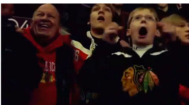
(6) Surprise http://youtu.be/Y5P5vpMOdyl