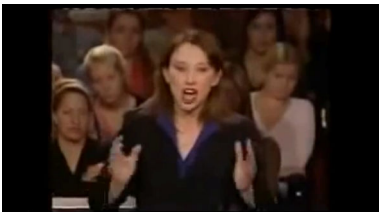
(5) Anger http://youtu.be/gn08hgH0Qal