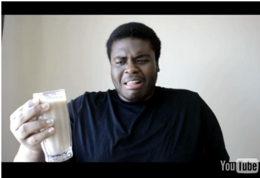
(3) Disgust http://www.tubechop.com/watch/734229